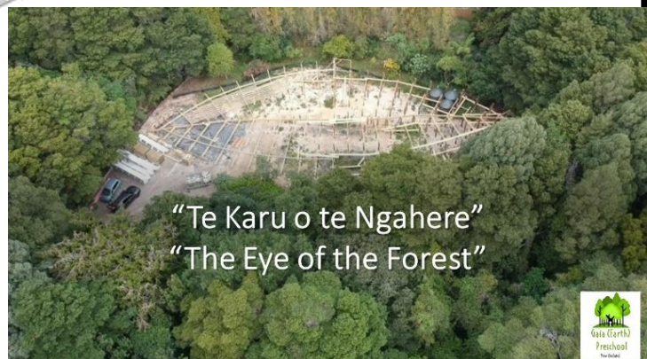
“Te Karu o te Ngahere” “The Eye of the Forest”

Note there are three shallow streams in blue and 100's of native trees in our forest which have been omitted for easier drawing purposes